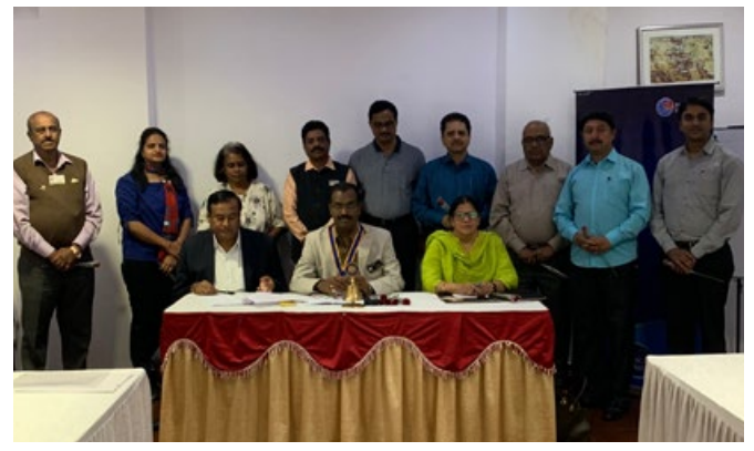
Nominations were received, scrutinized and the results were announced in 23rd Weekly Meeting of the year on the 19th of December, Wednesday, at Hotel Trinity Isle.